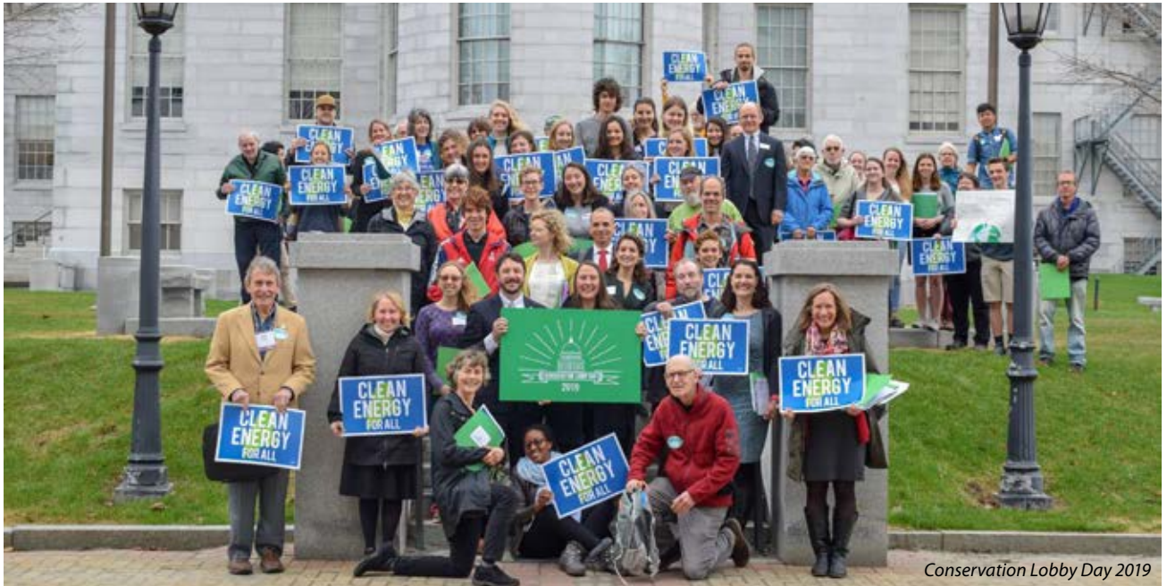
Conservation Lobby Day 2019